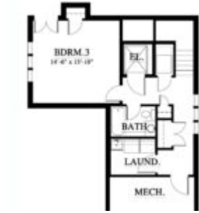
The Quarters - Garden Level Floor Plan