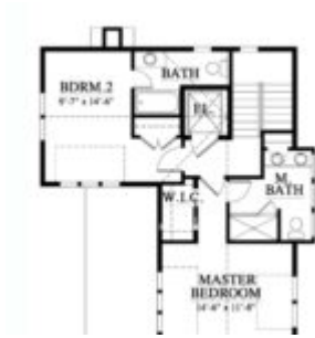
The Quarters - Second Level Floor Plan