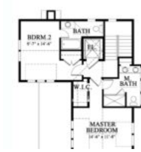
The Quarters - Second Level Floor Plan