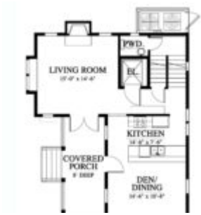
The Quarters - First Level Floor Plan