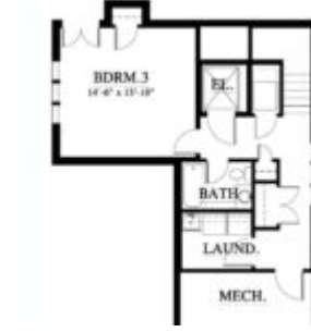
The Quarters - Garden Level Floor Plan