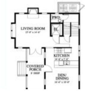
The Quarters - First Level Floor Plan