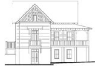
Architectural rendering of the Pigeon River home on Homesite 14 in Sanctuary Village