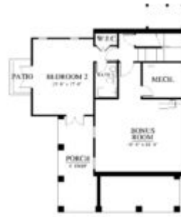
Floorplan of the Pigeon River home on Homesite 14 in Sanctuary Village