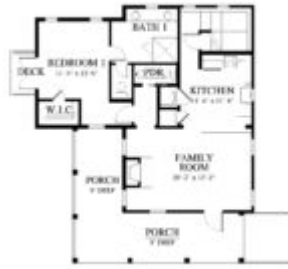
Floorplan of the Pigeon River home on Homesite 14 in Sanctuary Village