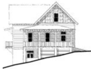
Architectural rendering of the Pigeon River home on Homesite 14 in Sanctuary Village