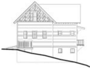
Architectural rendering of the Pigeon River home on Homesite 14 in Sanctuary Village